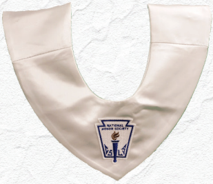
National Honor Society