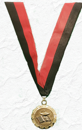
For having 10 or more College In The High School credits